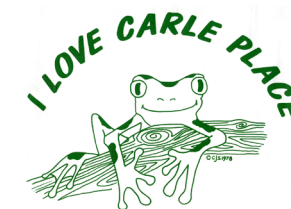
Illustration: Carl Santoro, ©1978