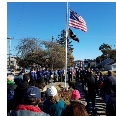
November 11th - Veteran's Day Memorial