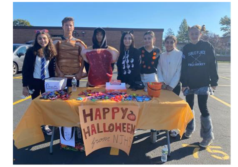
October 22nd - Trunk or Treat