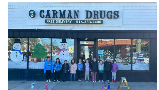
November 26th - December 2nd - Window Decorating