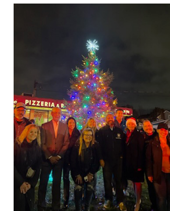
December 3rd - Annual Community Tree Lighting Ceremony