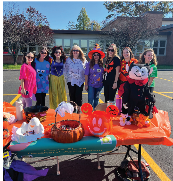
October 28th - Trunk or Treat