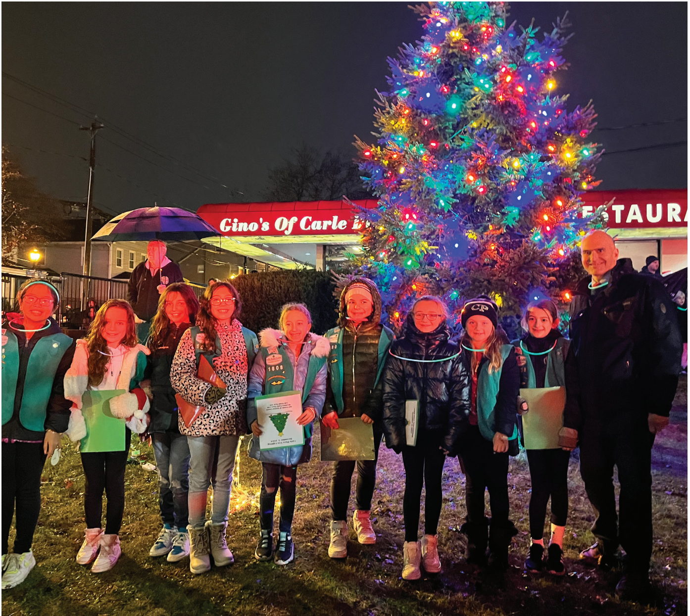
CPCA Christmas Tree Lighting

WE LOVE OUR HOMETOWN! CARLE PLACE CIVIC ASSOCIATION