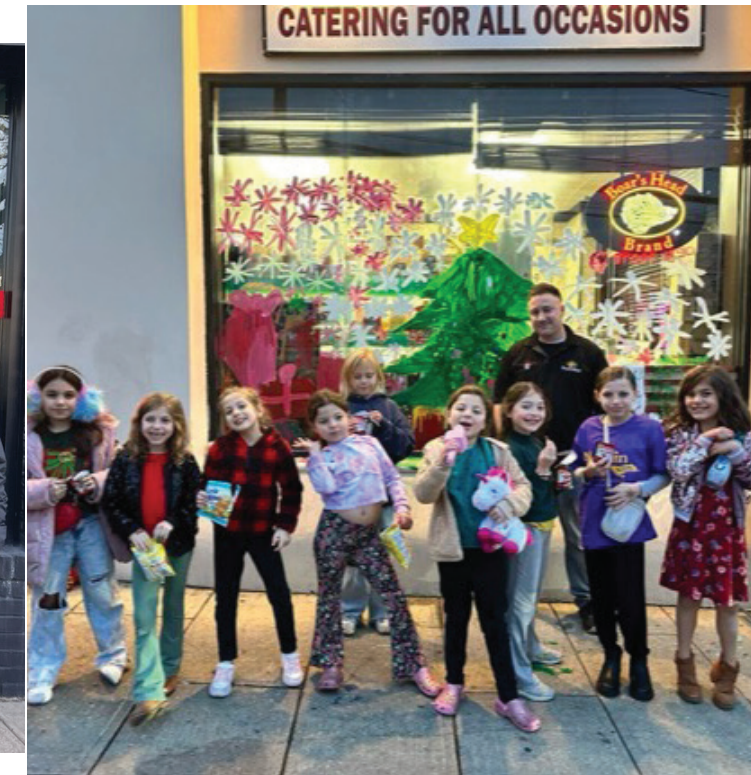
November 24th - December 2nd - Window Decorating