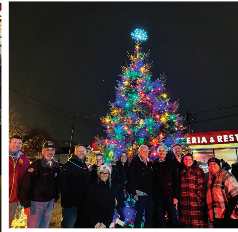
December 3rd - Annual Community Tree Lighting Ceremony