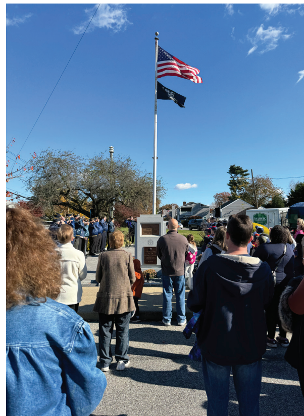
November 11th - Veteran's Day Memorial