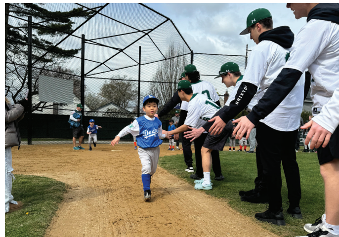
April 13th - Little League Opening Day Parade