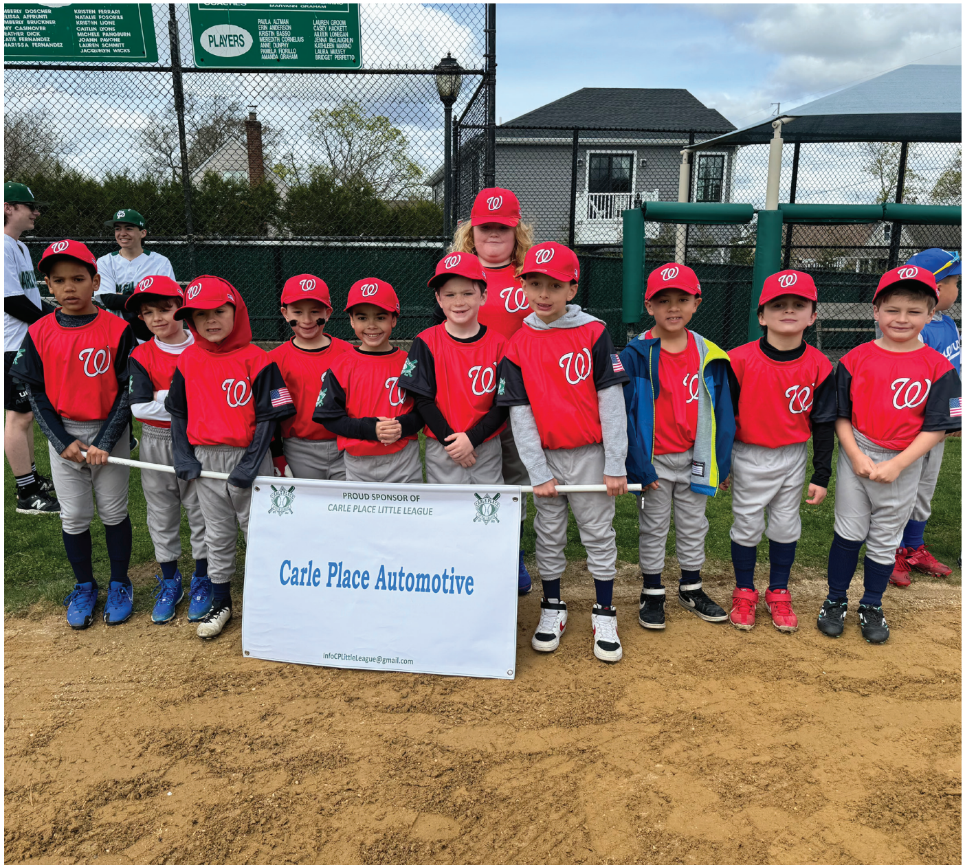
Carle Place Little League Opening Day

WE LOVE OUR HOMETOWN! CARLE PLACE CIVIC ASSOCIATION