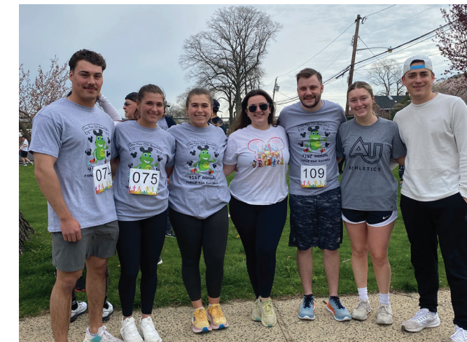
April 14th - Civic Association Family Fun Run