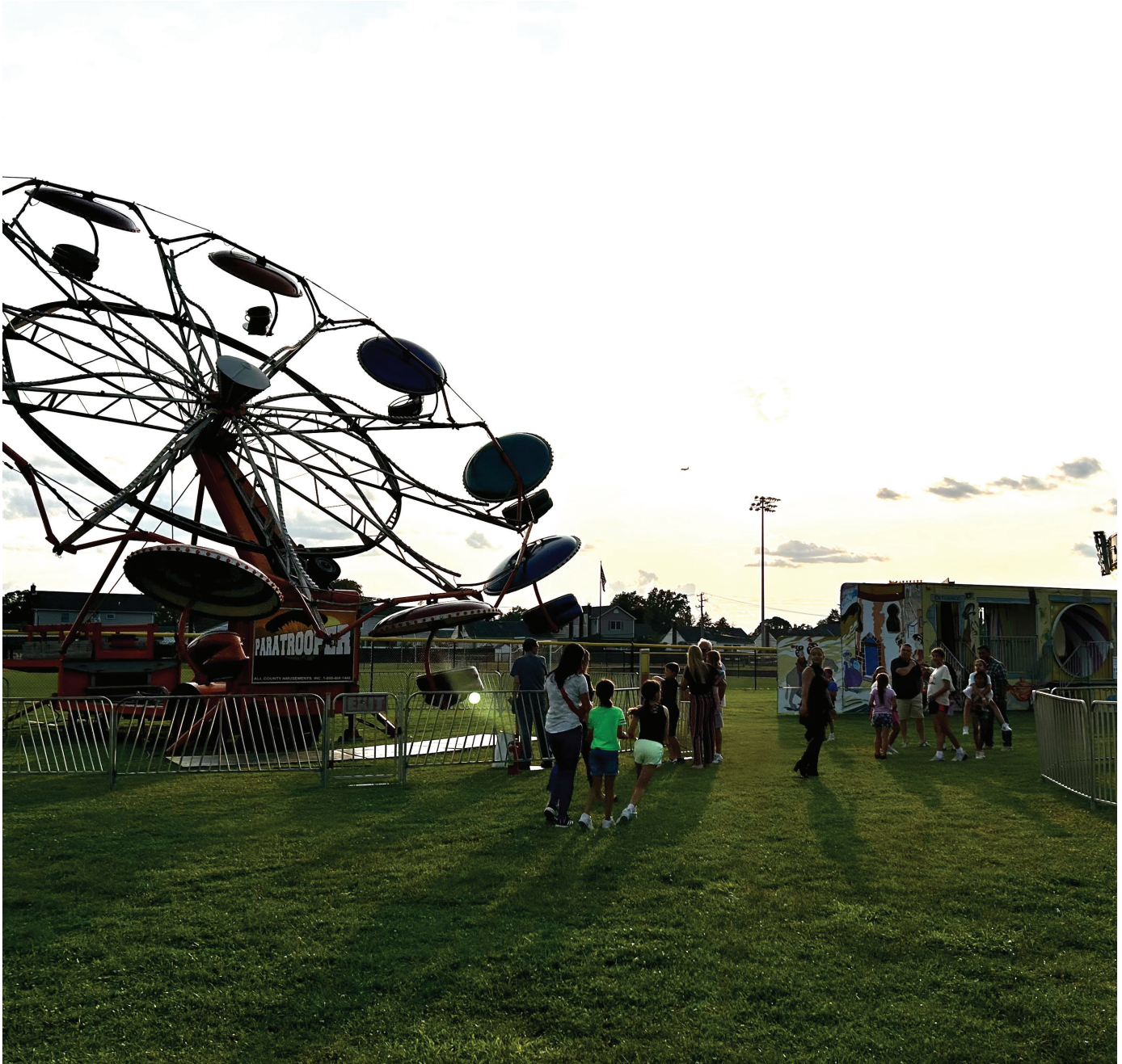
CPCA Carnival June '23

WE LOVE OUR HOMETOWN! CARLE PLACE CIVIC ASSOCIATION